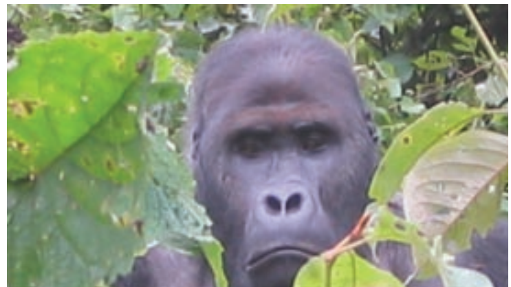
PAGE 16: Focus on Congo