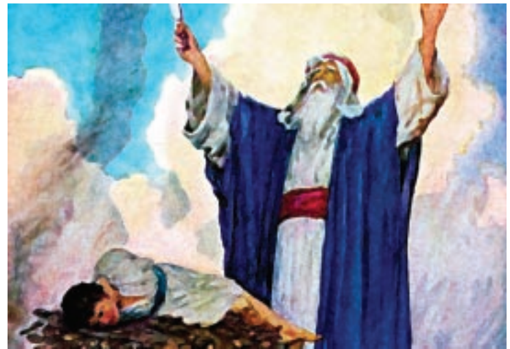
PAGE 8: Christ Our Righteousness

Cover photo: Whatever their circumstances, Christians have an anchor that is sure and steadfast. Their trust is well placed in the all sufficiency of Christ.