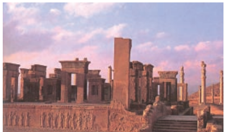
PAGE 20: A Long Way from Tehran